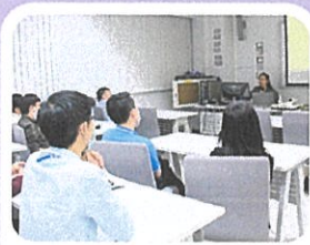
Face to face