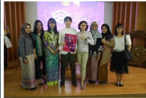
Peserta AYIC berfoto bersama.