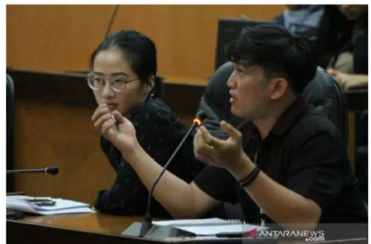
Delegasi dalam gelaran pembukaan AYIC 2018, yang dilaksanakan secara tatap muka.

Jakarta (ANTARA) - Universitas Padjadjaran (Unpad) kembali menggelar konferensi pemuda negara-negara Asia Tenggara, ASEAN Youth Initiative Conference (AYIC), kali ini melalui platform virtual di tengah pandemi, dengan menyoroti peningkatan akses untuk mendukung pembangunan berkelanjutan di kawasan.