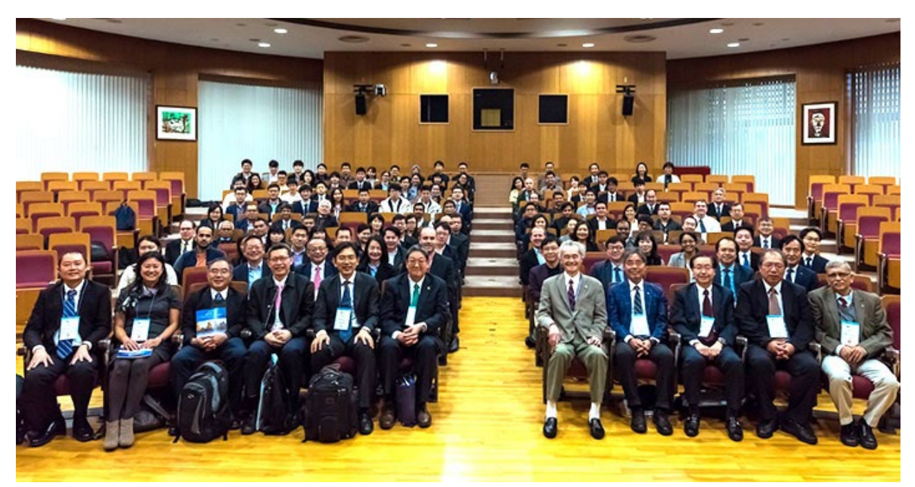
AOTULE Conference, November 2019, Ookayama Campus, Tokyo Institute of Technology

The Asia-Oceania Top University League on Engineering (AOTULE), founded in 2007, is a league of 13 premier engineering universities within Asia-Oceania region. The AOTULE promotes inter-university cooperation through joint programs including an annual Dean's meeting, student workshop and exchanges of students and staff, in order to improve the quality of engineering education and research of the members. It aims to broaden participating students' perspectives through education, research and cross-cultural interactions (excerpts from AOTULE website).