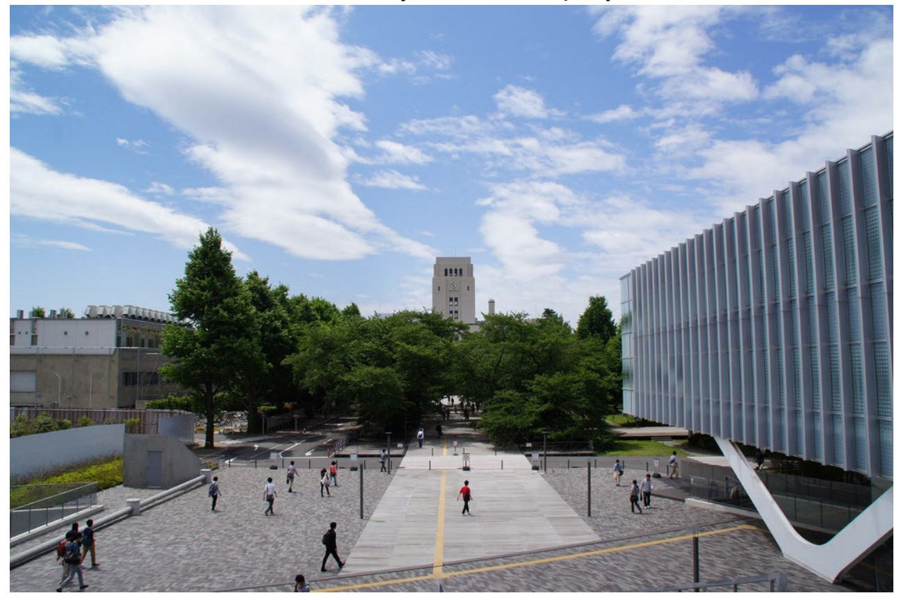
Main Building & Library, Ookayama Campus, Tokyo

Period: Thu 1 June, 2023 – Thu 31 August, 2023 Venue: Tokyo/Yokohama, Japan