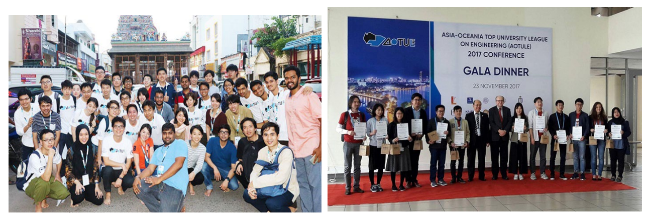
AOTULE Conference 2018 Indian Institute of Technology Madras

AOTULE Conference 2017 Hanoi University of Science and Technology